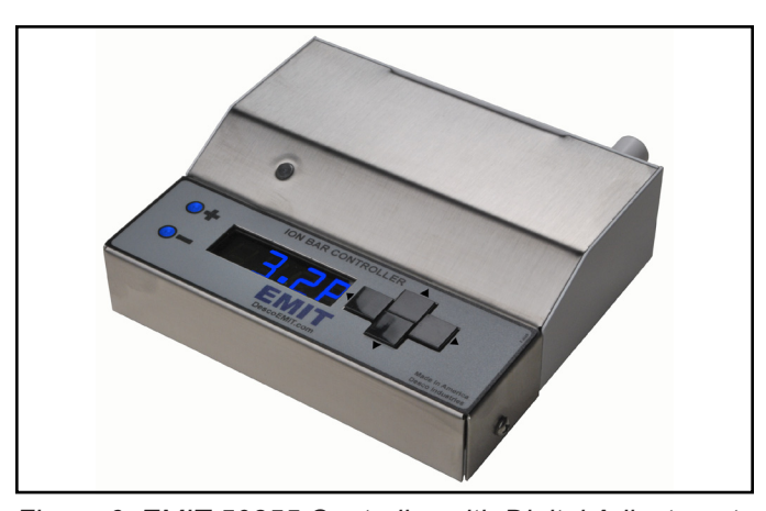
Figure 6. EMIT 50855 Controller with Digital Adjustment