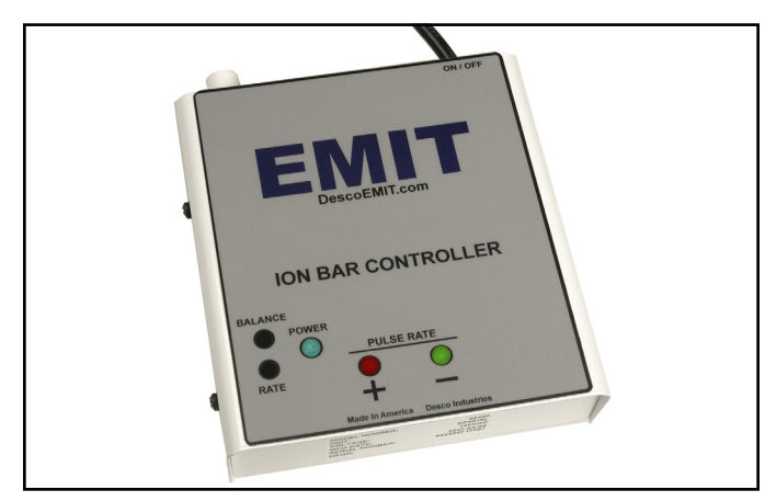
Figure 4. EMIT 50940 Controller with Recessed Potentiometer Adjustment