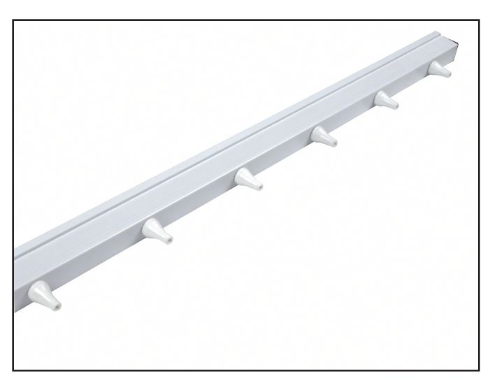
Figure 1. EMIT Non-Air Assisted Ion Bar