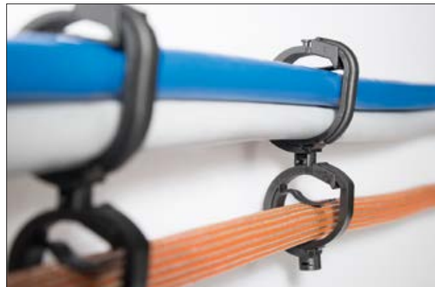
IAHC( )AH in combination with an IAHC( )T.