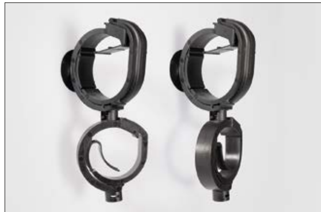
IAHC( )AH in combination with an IAHC( )T.