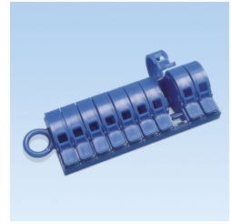
PM D EMPTY DISPENSER